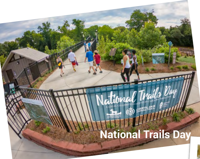
National Trails Day