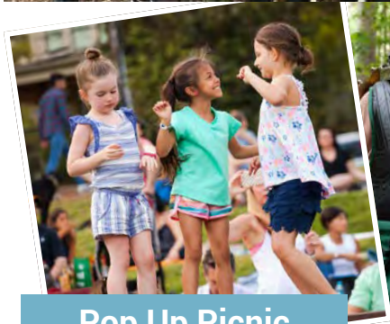
Pop Up Picnic