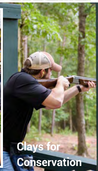
Clays for Conservation