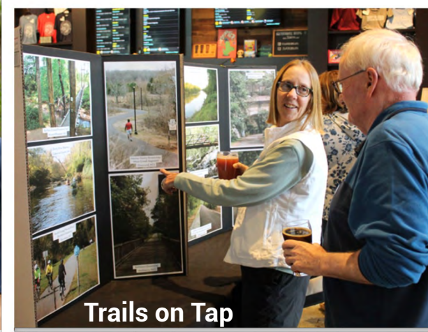
Trails on Tap