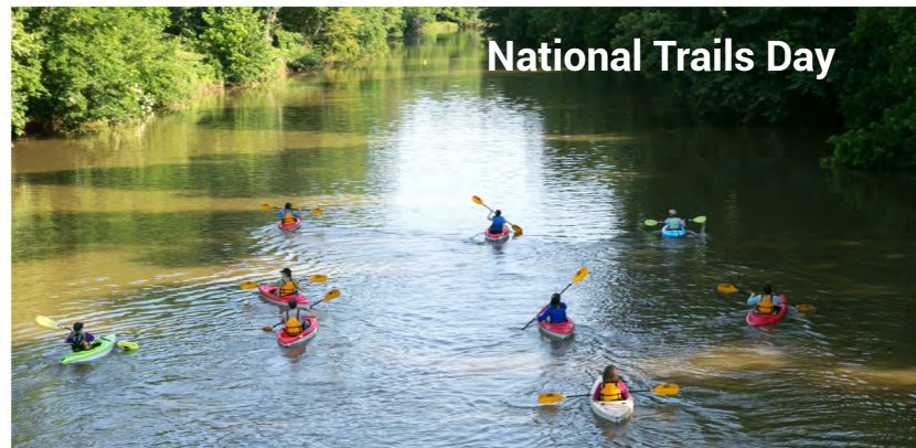
National Trails Day