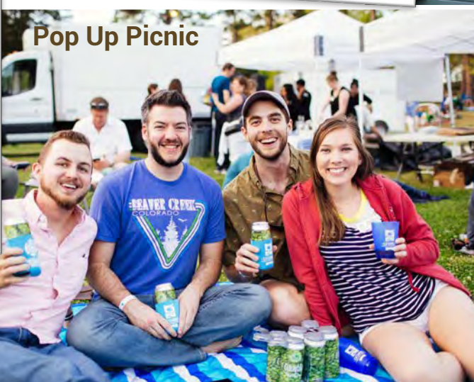
Pop Up Picnic