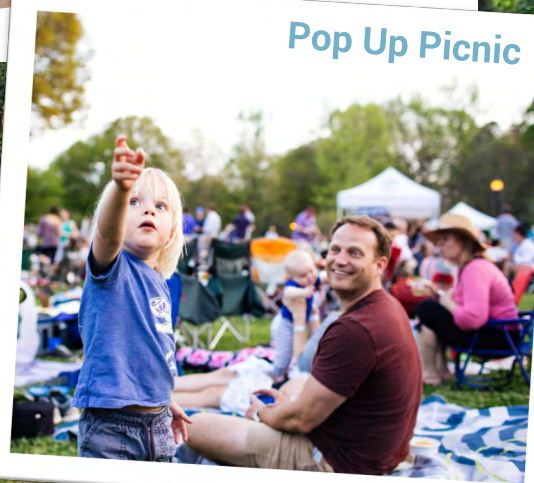
Pop Up Picnic