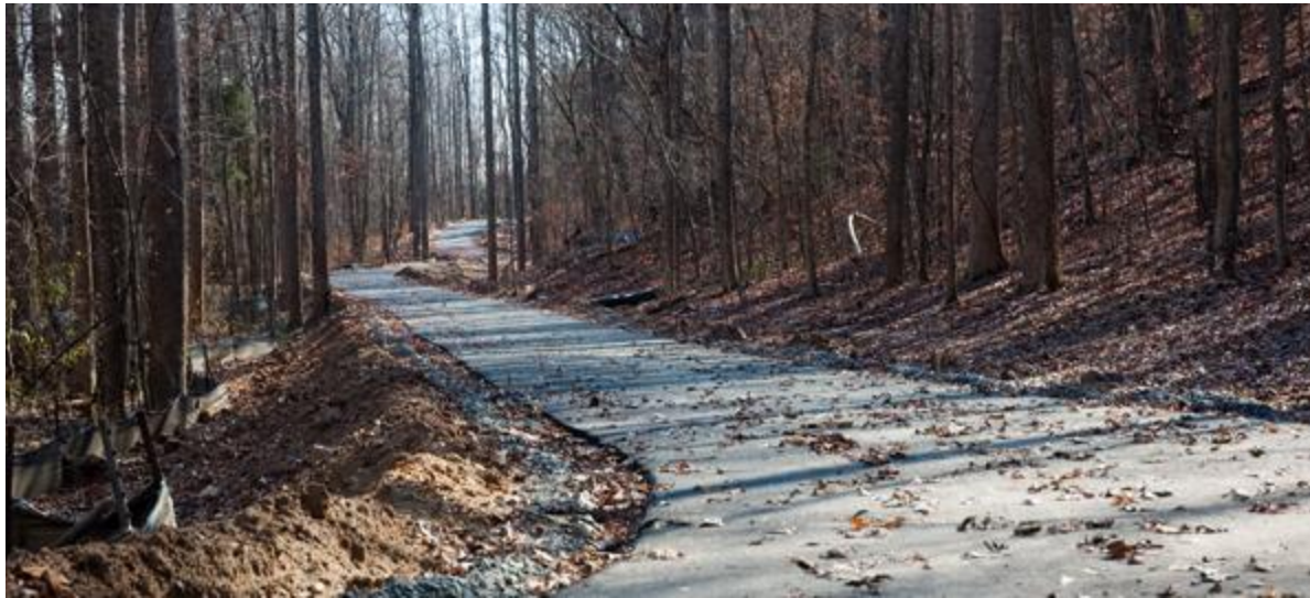
Section of greenway looking east toward Shearer Road.

Construction is nearly complete on the 1.1-mile West Branch Rocky River Greenway , which snakes through the River Run neighborhood and along the river east of downtown Davidson. Mecklenburg County Parks & Recreation is constructing the trail with the help of $1.1 million in federal stimulus funds.