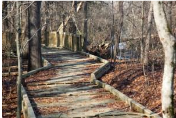
A boardwalk runs along a fern-covered hillside on the left and the river on the right.