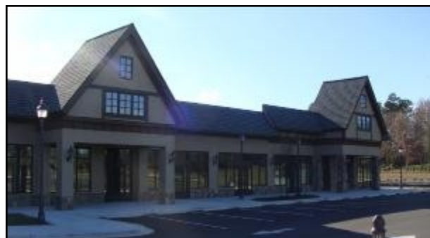
Austin Village's architecture features the look of an English village.

Austin Village will have 375,000 square feet of retail, medical and professional office space at full build-out, and 40 acres have been reserved for future residential development