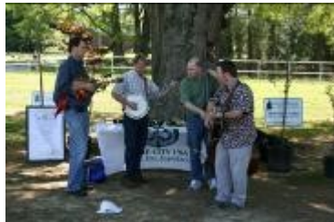
Local bluegrass musicians performing at last year's festival