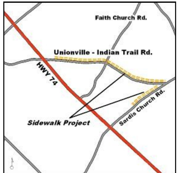
Unionville Indian Trail Road Sidewalk