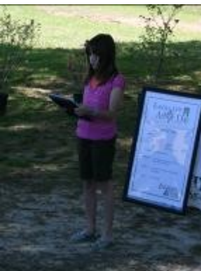
Student Poetry Contest from '09