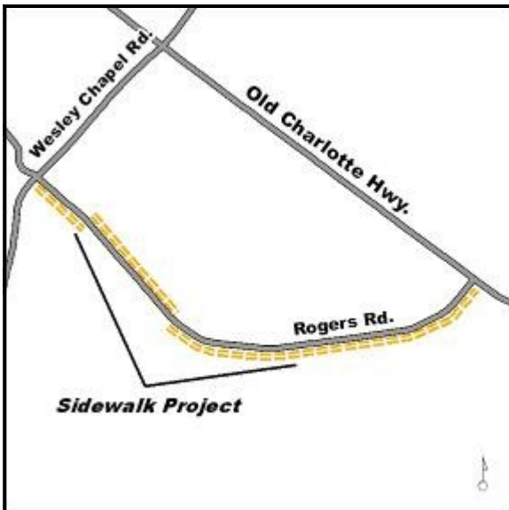
Rogers Road Sidewalk

these sidewalk projects comes from the federally funded Congestion Mitigation and Air Quality (CMAQ) Improvement Program. These projects are part of an overall effort by the Town to fulfill the vision of the Town's Pedestrian Plan to make Indian Trail a more walkable community. Please contact the Engineering Department at 704-821-1314 for additional information.